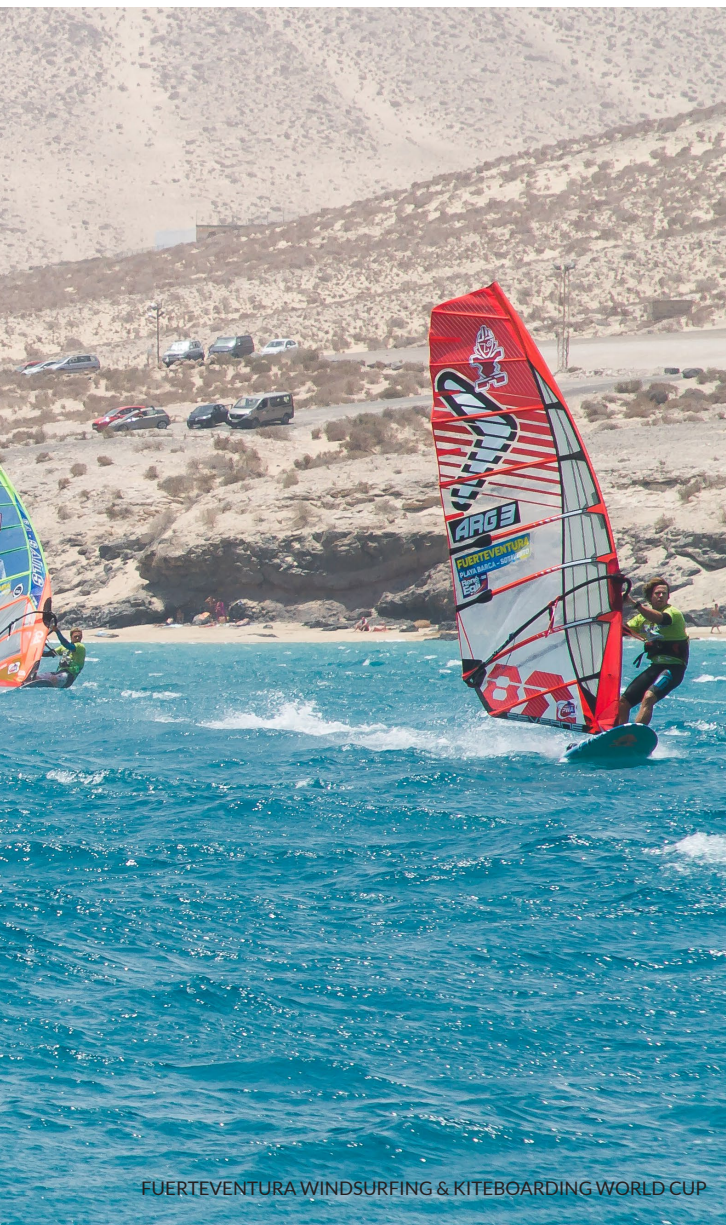
FUERTEVENTURA WINDSURFING &amp; KITEBOARDING WORLD CUP

📍 Where: Isla Canela (Huelva), Oliva (Valencia), Tarifa (Cádiz) When: April, June and September