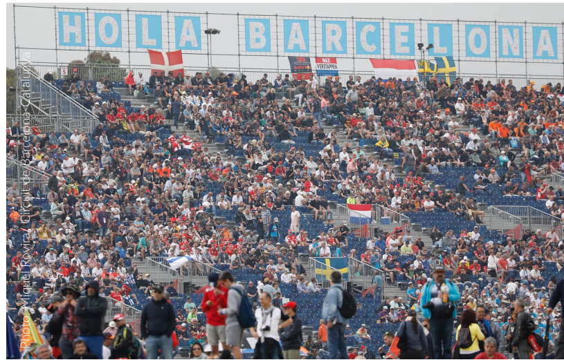
▲ SPANISH FORMULA 1 GRAND PRIX MONTMELÓ