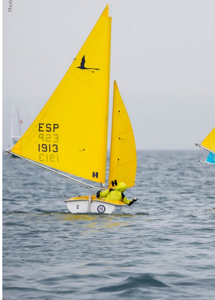
▲ PALMAVELA REGATTA BALEARIC ISLANDS

The Real Club Náutico de Palma de Mallorca is the main headquarters for this competition in which the main attraction are the really big yachts, but you'll also see some speedy, light carbon fibre boats, extraordinary classic yachts, agile one-design yachts and thrilling regattas in real time.