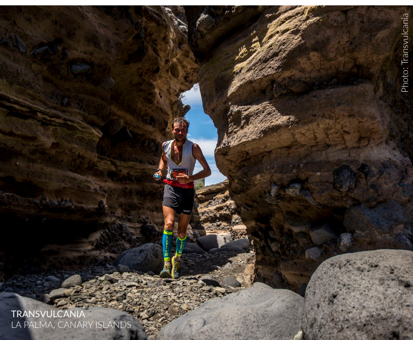
TRANSVULCANIA LA PALMA, CANARY ISLANDS