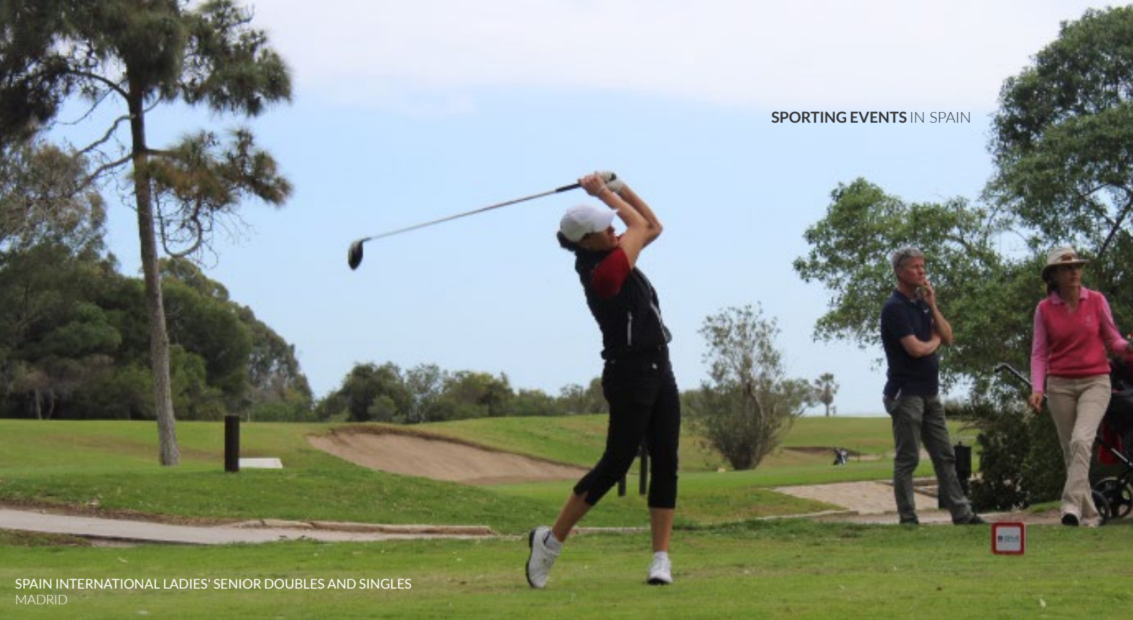
SPAIN INTERNATIONAL LADIES' SENIOR DOUBLES AND SINGLES MADRID