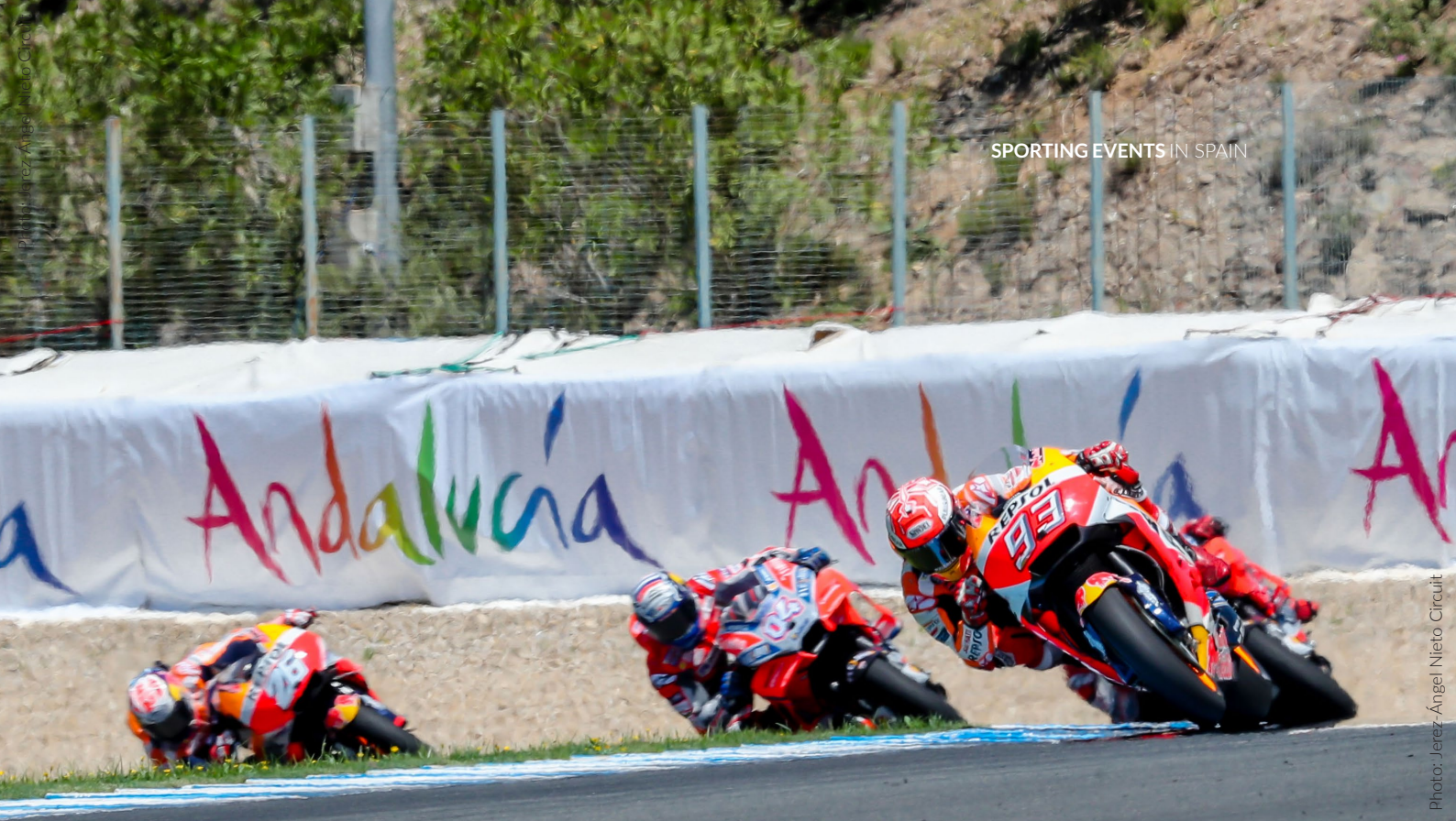
▲ SPANISH MOTOGP GRAND PRIX JEREZ