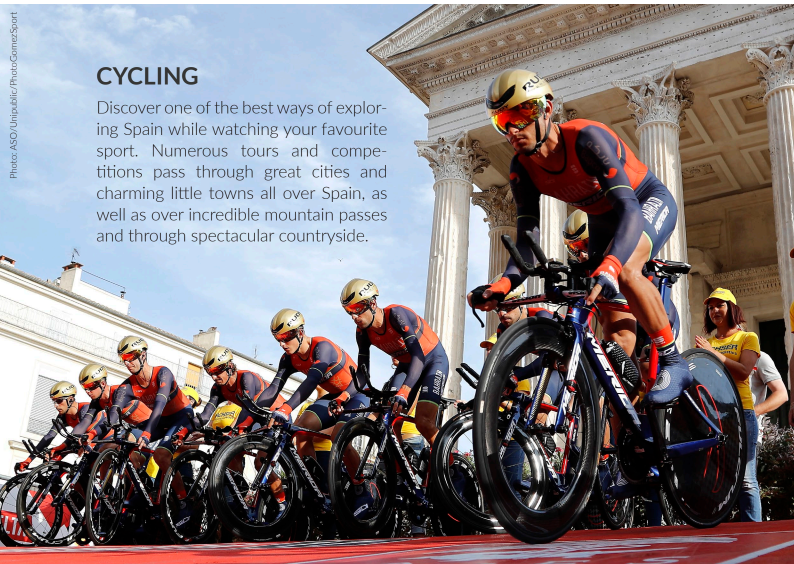
▲ VUELTA CICLISTA CYCLE RACE AROUND SPAIN

Discover one of the best ways of exploring Spain while watching your favourite sport. Numerous tours and competitions pass through great cities and charming little towns all over Spain, as well as over incredible mountain passes and through spectacular countryside.