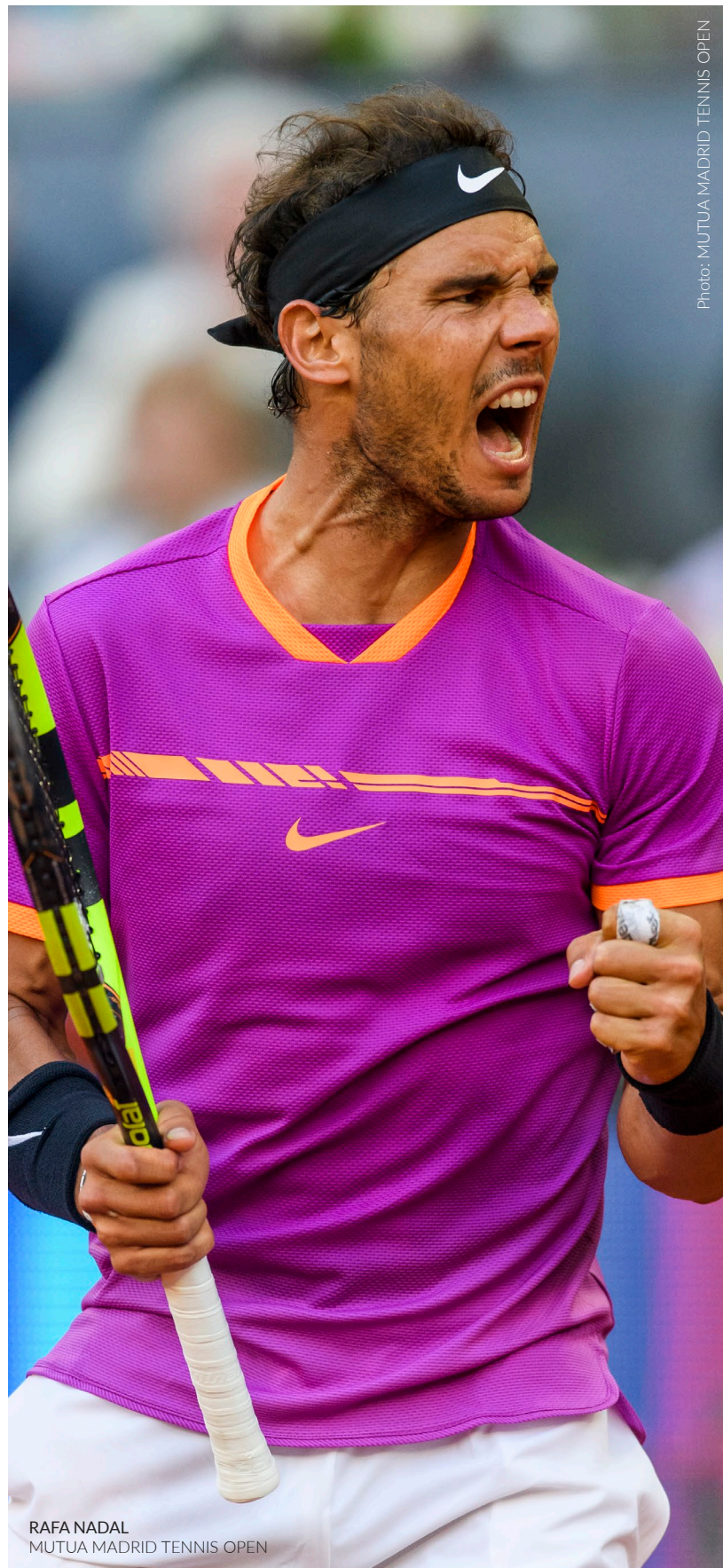
RAFA NADAL MUTUA MADRID TENNIS OPEN

Apart from a large shopping centre where you'll find the most prominent Spanish and international brands, you can also take part in a virtual tennis tournament which attracts more and more players each year. The winner of this tournament gets to meet the winners of the Madrid Open face-to-face.