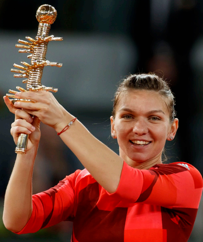
▲ MUTUA MADRID TENNIS OPEN

You can watch games from a unique perspective, as if you were the Hawk-Eye, in the Tennis Garden, a walkway over the courts where you can see the players in action like you've never done before.