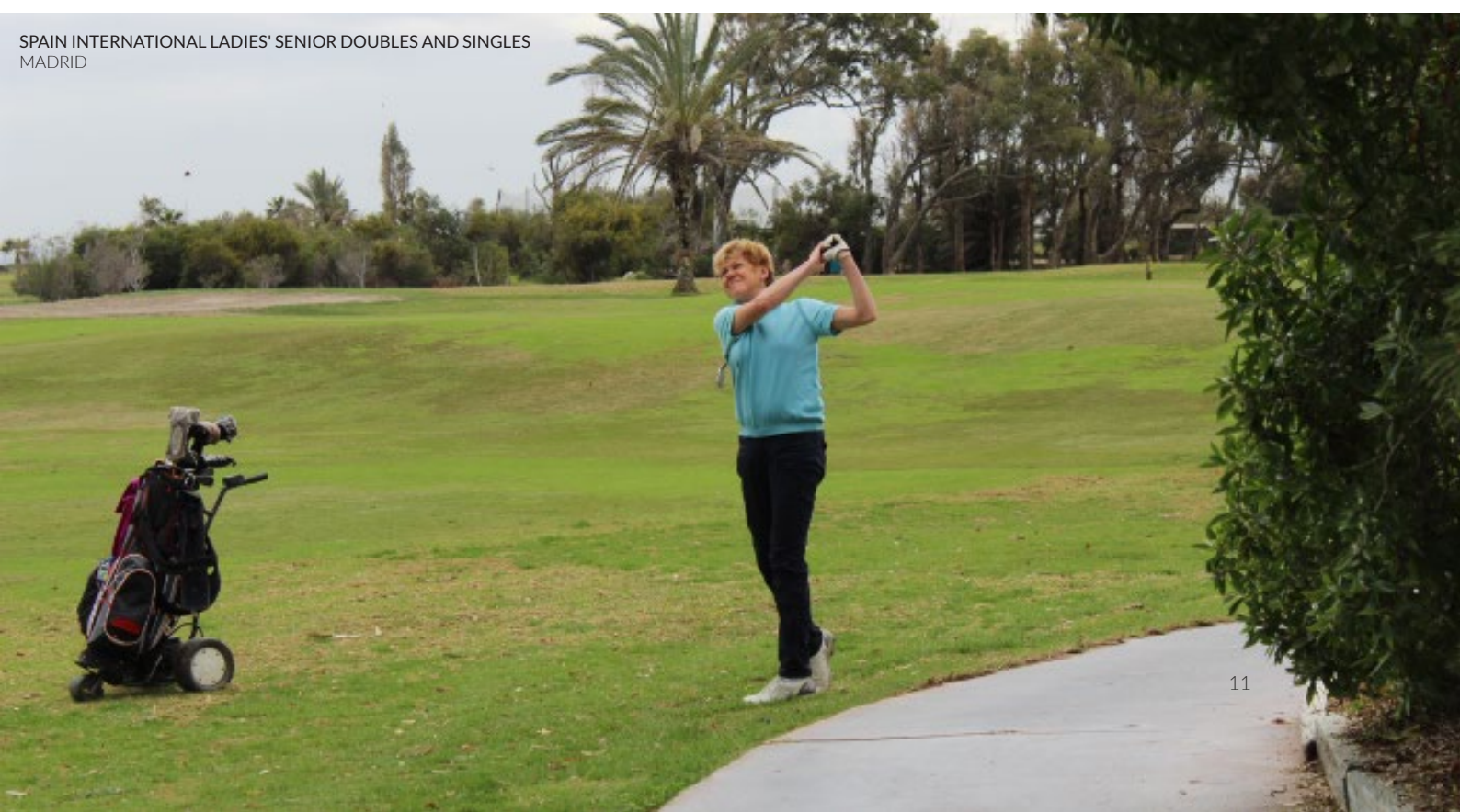
SPAIN INTERNATIONAL LADIES' SENIOR DOUBLES AND SINGLES MADRID

📍 Where: venue changes each year When: March