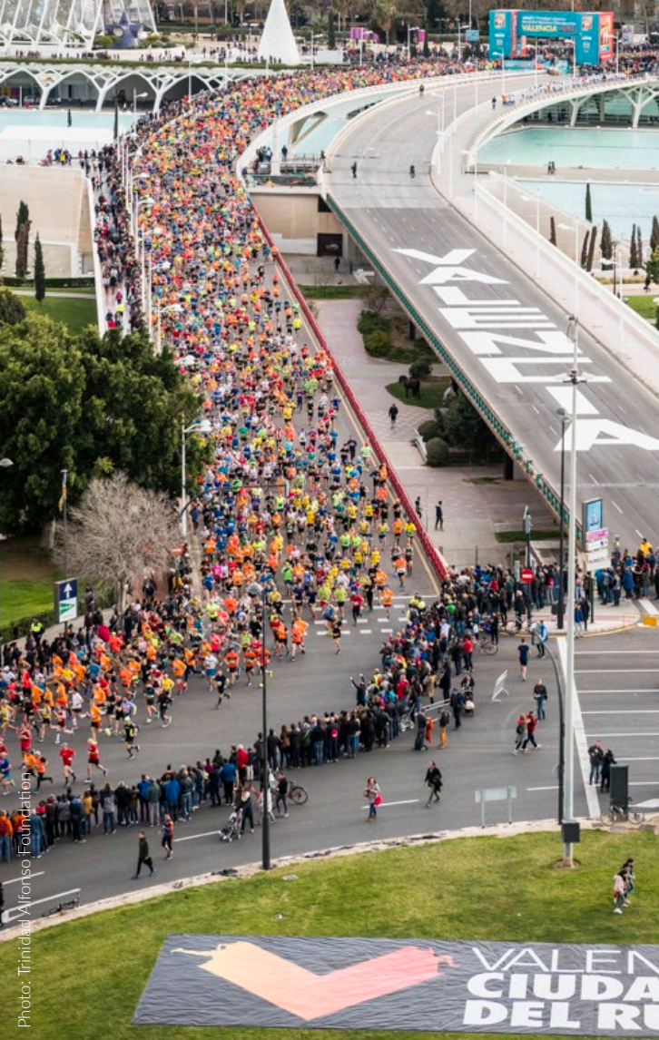
▲ IAAF 2018 WORLD HALF MARATHON CHAMPIONSHIP VALENCIA