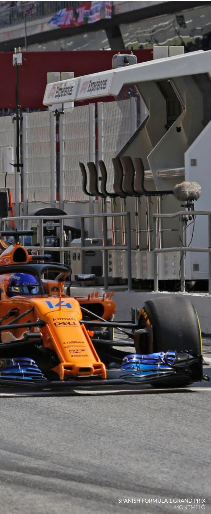
SPANISH FORMULA 1 GRAND PRIX MONTMELÓ