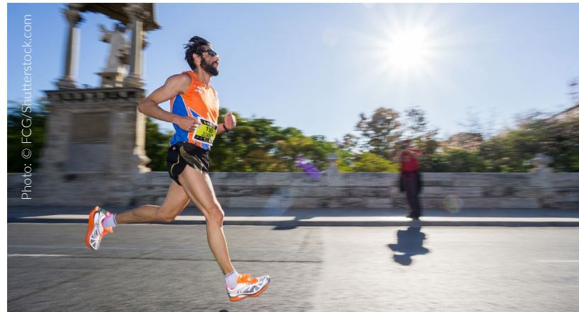
▲ IAAF WORLD MARATHON CHAMPIONSHIP VALENCIA

Do you like running in good weather, near the sea and with an appreciative crowd watching? The circuit in Valencia is absolutely flat and next to the avant-garde City of Arts and Sciences , with a temperature of between 17 and 22°C and excellent organisation. It must have something if the IAAF (International Association of Athletics Federations) has awarded the Gold Label classification to both the marathon and the half marathon. The spectacular finish line is located on a gangway over the water next to the Umbracle and the Science Museum.